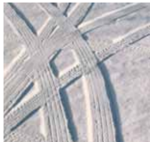
Waffle Weave Blanket & Pillowcase Single/Queen/King