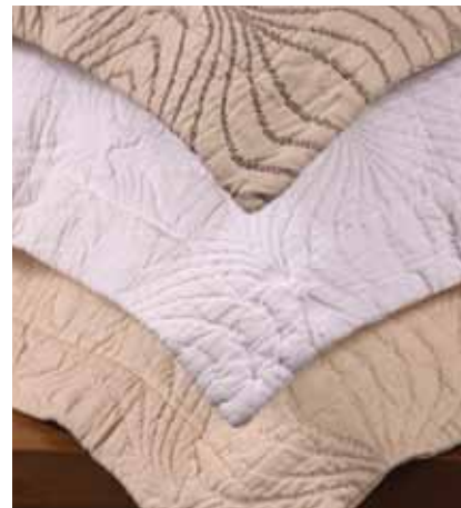
Colourways - Natural/Chocolate, White, Natural