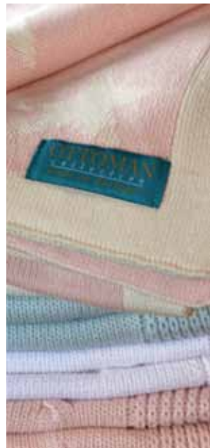
Baby Blankets Knitted Cotton