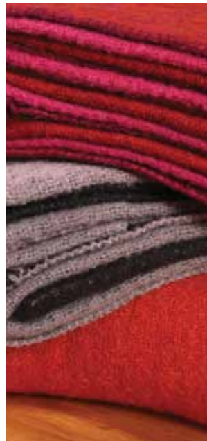
Mohair Wool Boucle Throw Rugs