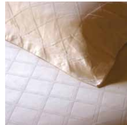
Mendes Duvet Cover & Oxford Pillowcase - Standard/Euro