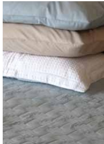
Quilted Bed Cover - Single/Queen/King Duck Egg Blue, White, Taupe, Green, Silver