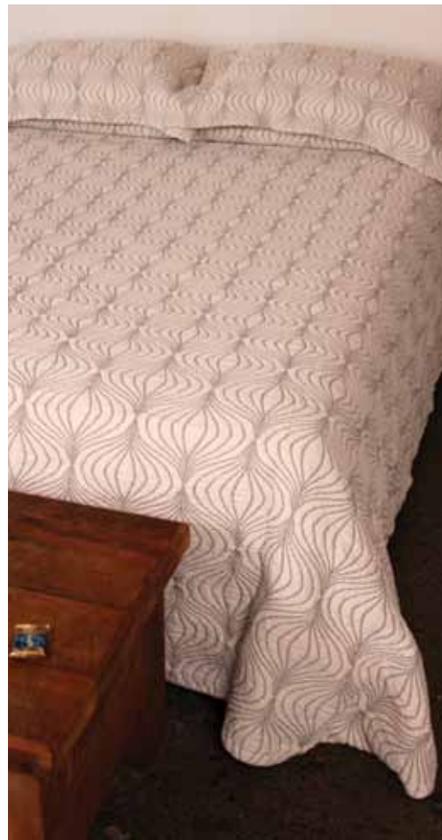
Lantern Bedspread - Single/Queen/King