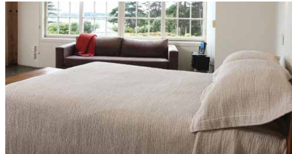
Vassilis Linen/Cotton Bedspread - Queen/King & Standard Oxford Pillowcase