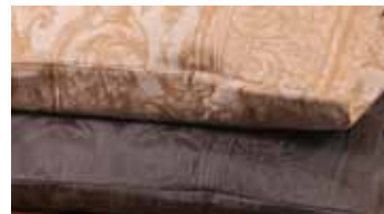
Constantine Pillowcase - Standard - Gold/Charcoal